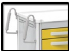
Flexible plastic top